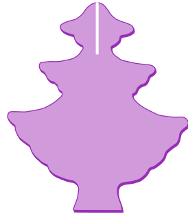
Part B 12 Wood Pieces